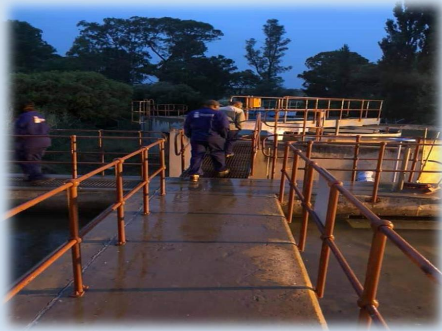
Upgrade of the Rouxville Water Treatment Works (WTW)

The annual target of this project is practical completion of the by 30 March 2020.