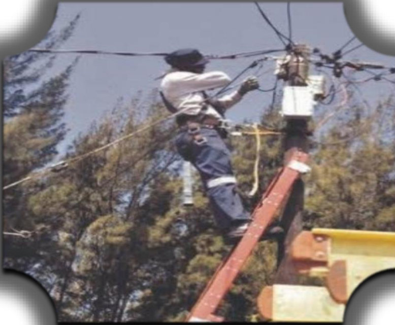
Rouxville/Rolelathunya ext.6 electrification of households.

The annual target of this project is to provide electricity to 134 houses at Rolelathunya ext.6 by 30 June 2020.