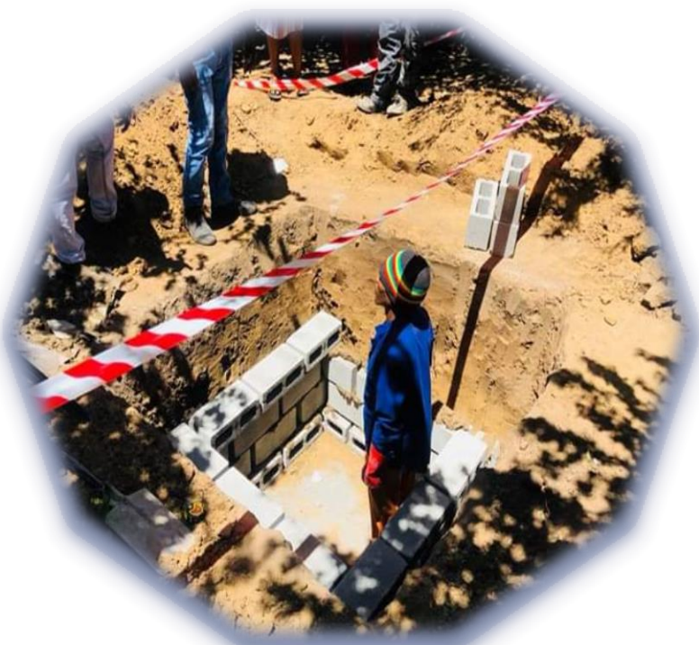
Installation of on-site sanitation units for 410 households in Refeng-khotso

The annual target of this project is to install on-site sanitation units for 110 households in Refeng-khotso by 30 June 2020.