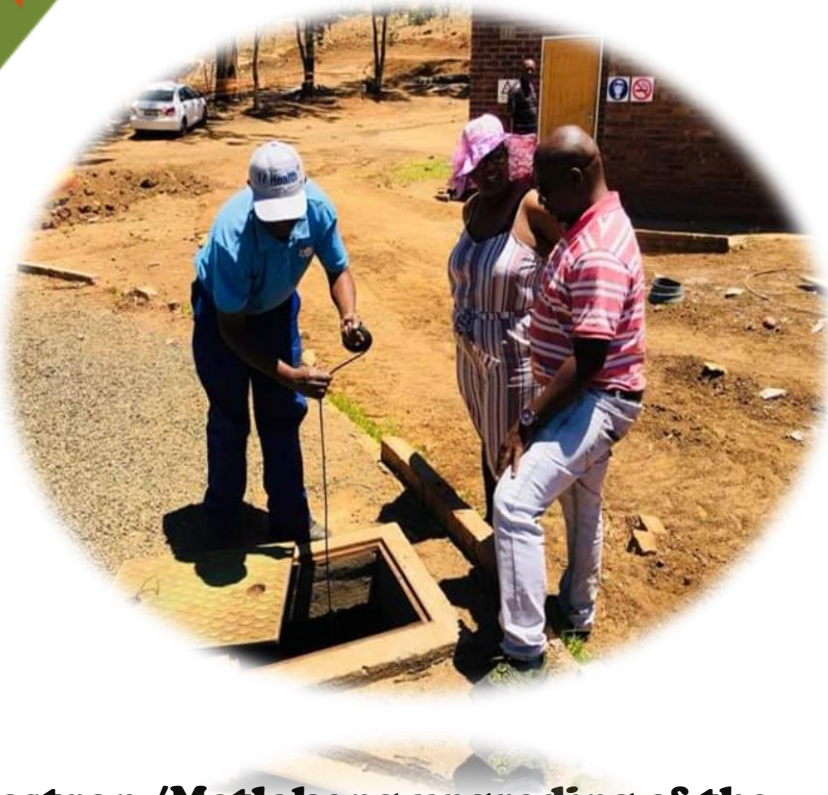
Zastron /Matlakeng upgrading of the outfall sewer line and refurbishment of sewer pump station.

The annual target of the project is 35% physical progress on the site by 30 June.