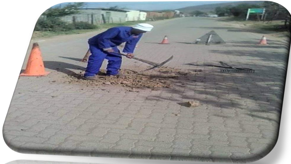
Upgrading of the 0.6km Zama access road in Zastron /Matlakeng.

The annual target of this project is practical completion of the it by 30 December 2020.