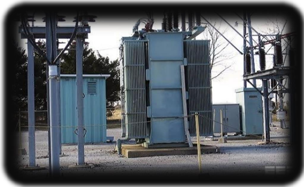
Construction on the primary substation building next to Ou Kragstasie

The annual target of this project is practical completion of the Ou Kragstasie by March 2020.