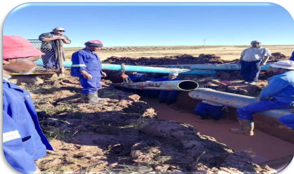
Construction of a 27km long raw bulk water pipeline from Orange River to Paisley Dam in Rouxville.

The annual target of this project is practical completion of the project by 30 March 2020.